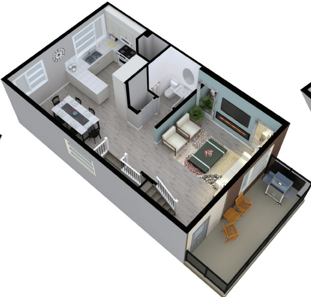
Main Floor: 652 S.F.